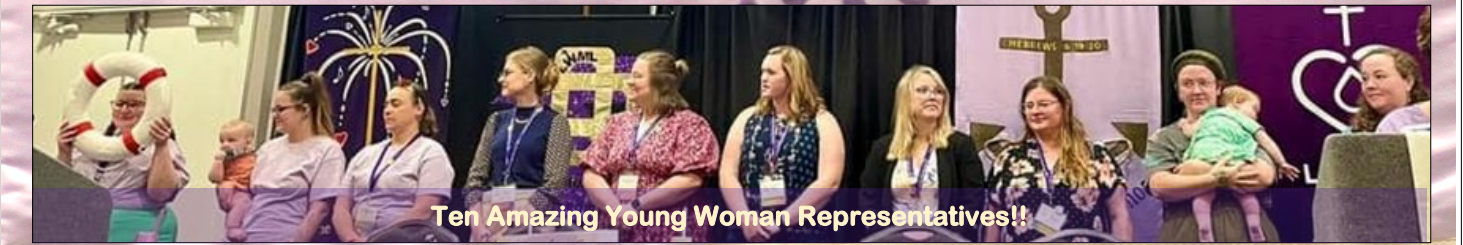
Ten Amazing Young Woman Representatives!!

Look for more convention information, including all the zone banners and their descriptions, on the website, kansaslwml.org/2024-lwml-kansas-district-convention .