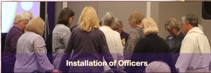
Installation of Officers