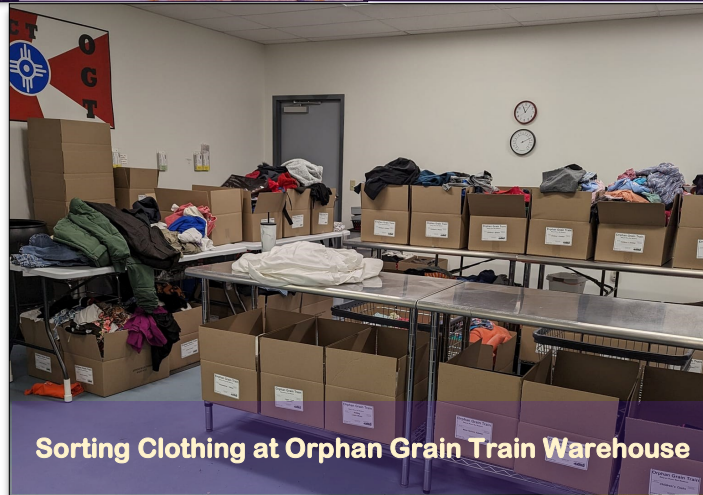
Sorting Clothing at Orphan Grain Train Warehouse