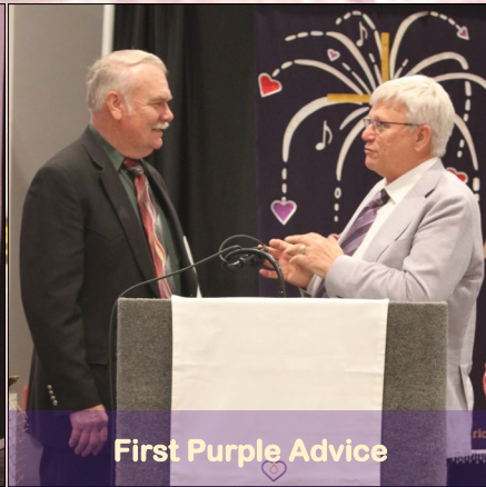
First Purple Advice