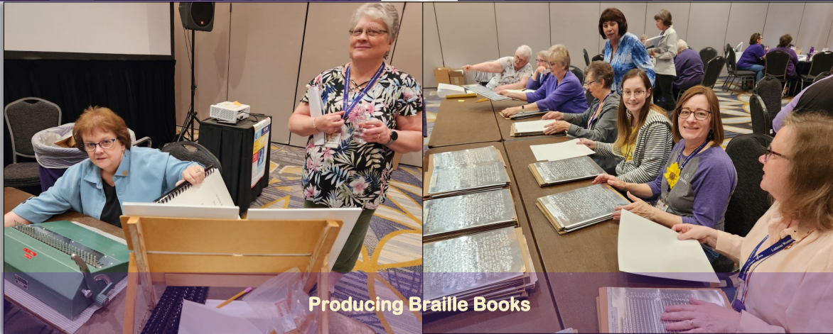
Producing Braille Books