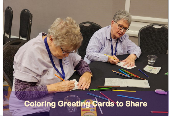
Coloring Greeting Cards to Share