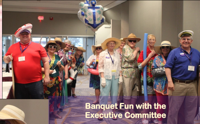
Banquet Fun with the Executive Committee