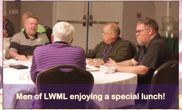
Men of LWML enjoying a special lunch!