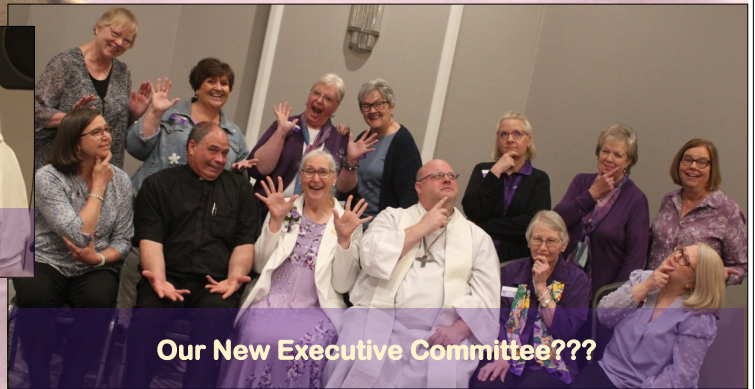
Our New Executive Committee???