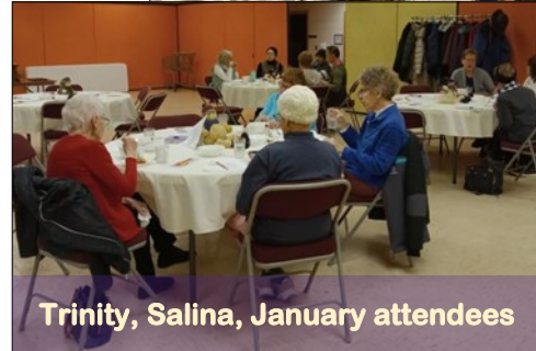
Trinity, Salina, January attendees