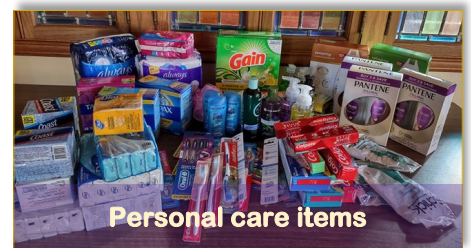
Personal care items

ZION LWML, PITTSBURG , in observance of LWML’s 80th anniversary, and in conjunction with LWML Sunday, collected personal care items for Wesley House, which serves low-income residents of Crawford County. The goal was to collect 80 items; the actual number collected was 164!