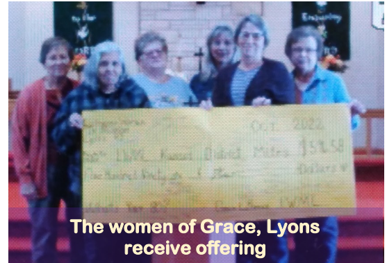
The women of Grace, Lyons receive offering