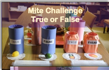
Mite Challenge True or False