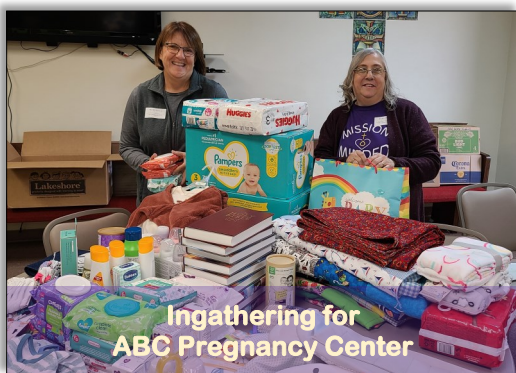
Ingathering for ABC Pregnancy Center