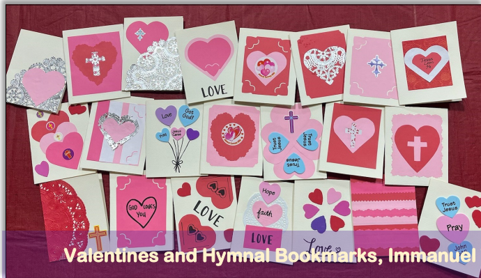
Valentines and Hymnal Bookmarks, Immanuel WinGS, Hepler

The members of IMMANUEL LWML WinGS, HEPLER , hosted a project day in January. The ladies made 22 Valentines for residents of Westridge Assisted Living Facility, and constructed 126 ribbon bookmarks for the church hymnals. We also cut out flannel burp cloths for Vie Medical Clinic, which provides free pregnancy services to women in the community. Our next event will be a Women's Brunch in February.