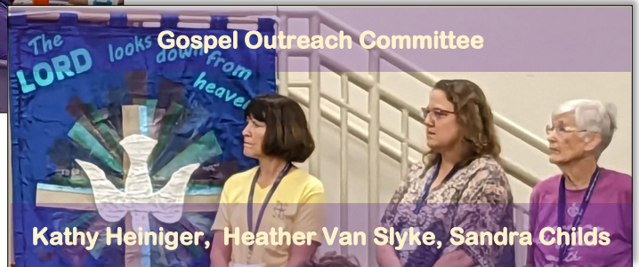
Gospel Outreach Committee