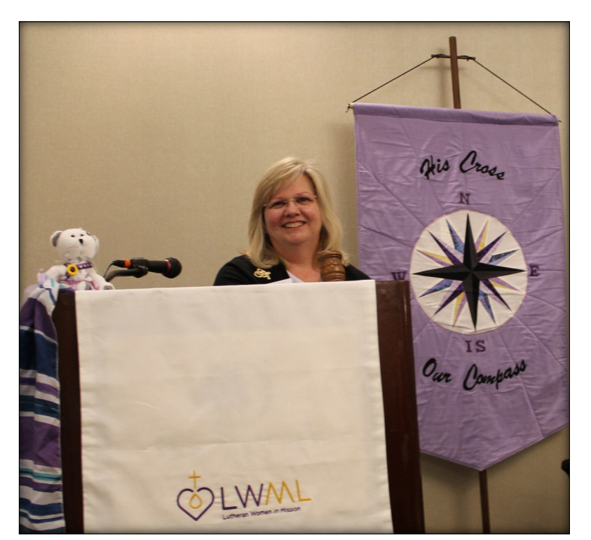
HUS N Cross W F S Cempass

Lead me in your truth and teach me, for you are the God of my salvation; for you I wait all the day long. (Psalm 25:5)