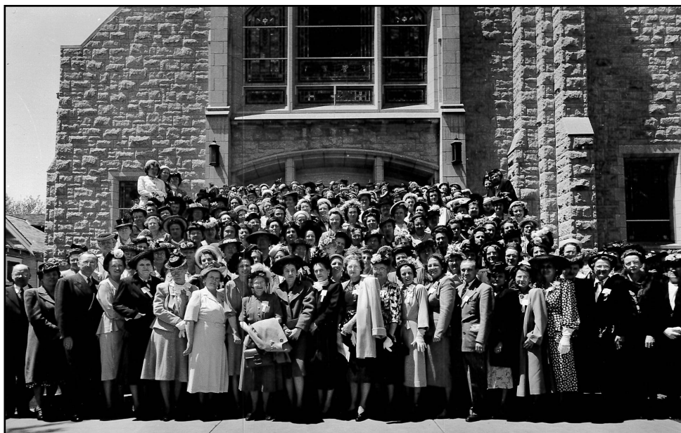
LWML Kansas District Convention "Onward Christian Women" Wichita April 28, 1948

Beginning in 2013, Zones planned mission focus and procured speakers themselves for their zone spring events.