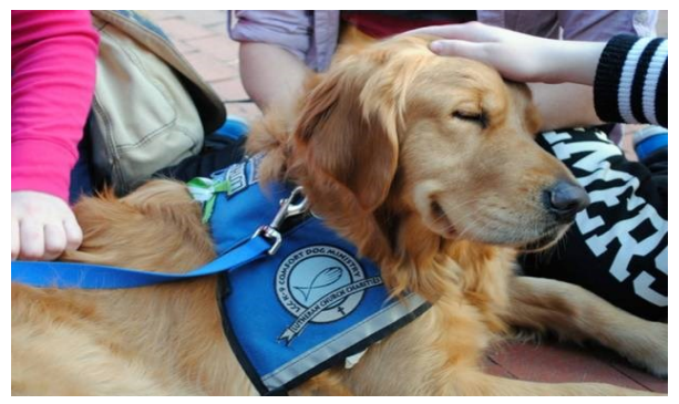
Immanuel Lutheran Comfort Dog Ministry Ellsworth, KS $750