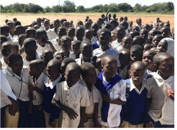
Mwadui Lutheran School Tanzania, Africa $5,300