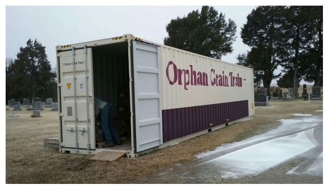
Orphan Grain Train Relief Center Herington, KS $2,000

The following were awarded God's Gracious Gift Fund grants from the Kansas District Lutheran Women in Mission as selected by delegates of the 2020 LWML Kansas District Convention.