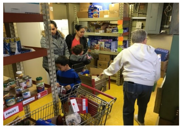
Immanuel Lutheran Church Food Pantry Kansas City, KS $1,600