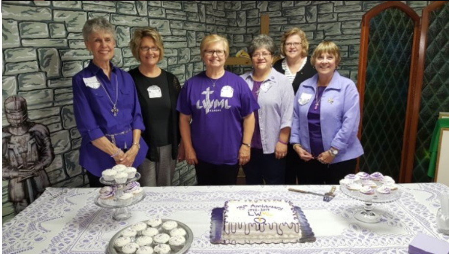
Pictured Bottom Left—Hostesses from St. Paul Lutheran Church, Preston