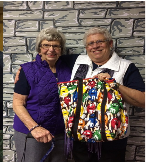
Pictured Top Left—Attendees in their retro hats and gloves