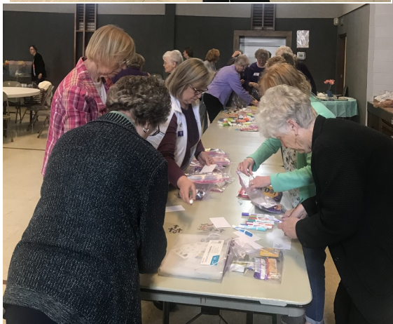
Ladies hard at work assembling the blessing bags