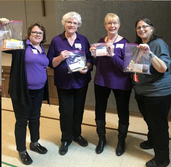
Finished Blessing Bags