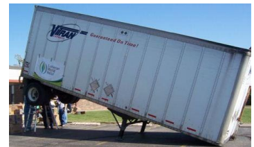
Loading the tilted truck