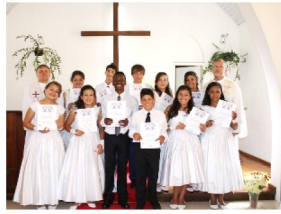
Confirmation class November 2011